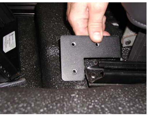
Slide under seat support brackets into position as shown